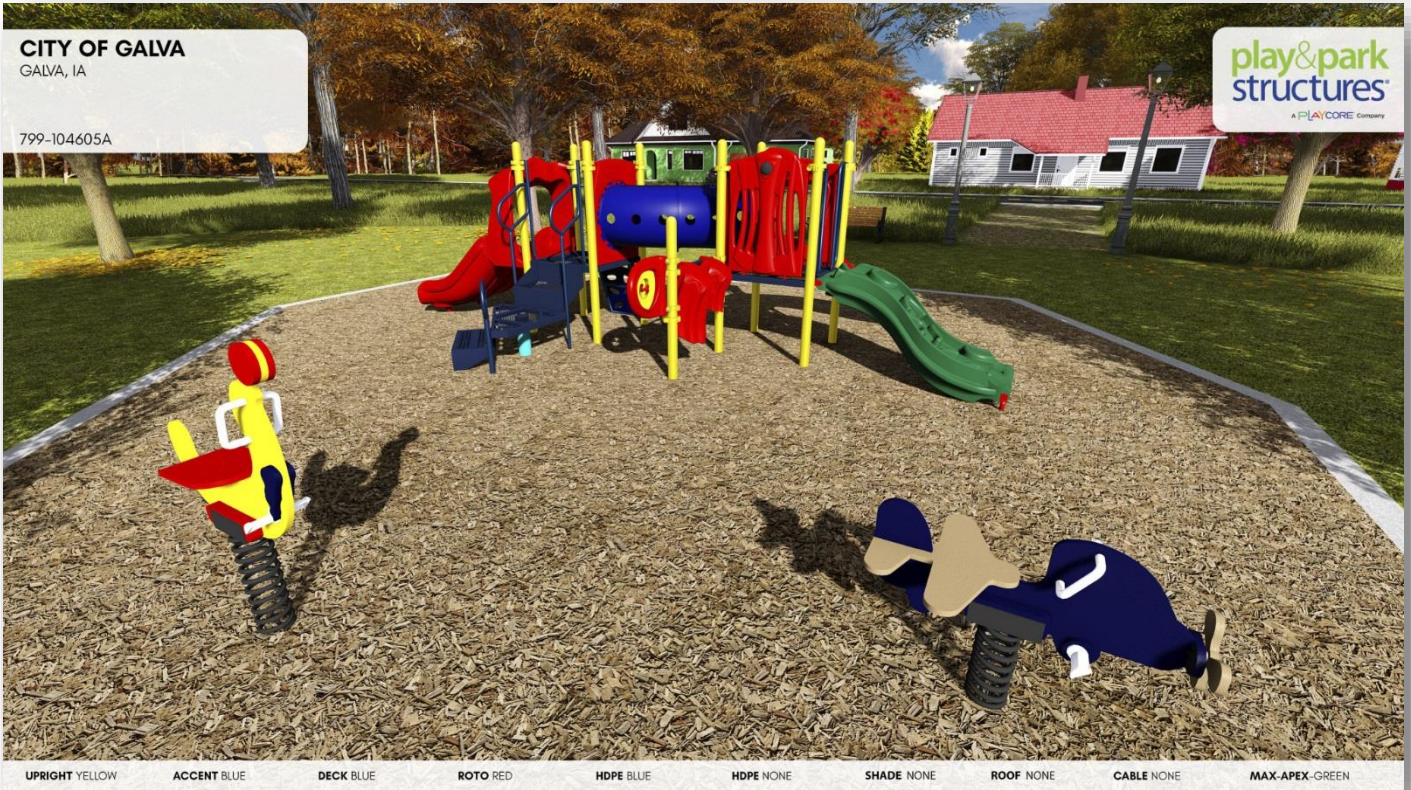
ABOVE: GIGGLE MAKER, SEAL BOUNCER WITH C SPRING AND SOLO FLYER BELOW LEFT: OVAL SWING FOR OLDER KIDS BELOW RIGHT: FOOTPRINT